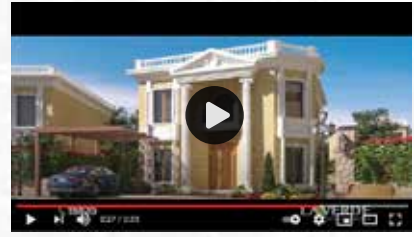
La Verde Casette لا فيردي كازيتا اول كمبوند فيلات علي الطراز الايطالي في العاصمة الادارية