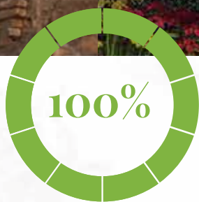
Realization of the concrete structure