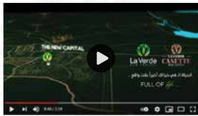
La Verde Casette, the first luxurious villa compound in R8 new capital