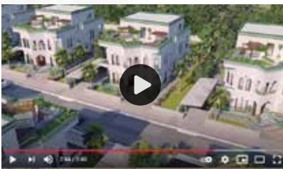
كمبوند لا فيردي العاصمة الإدارية الجديدة - La Verde New Capital compound