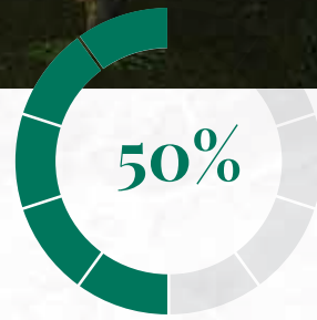
Interior and exterior finishes works