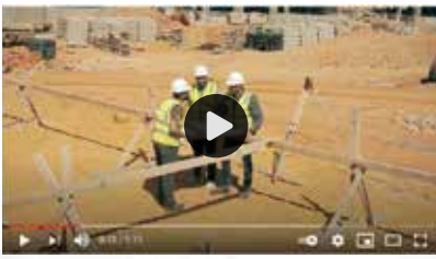
Construction Updates Jan 2021 LaVerde New Capital

eg.linkedin.com/company/ laverdedevelopments